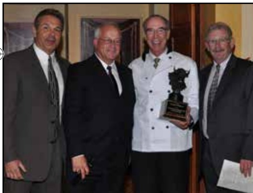
Michael Mondavi "Michael Mondavi Family Estate Wines"