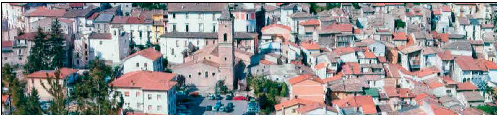
Ilio's Hometown: Introdacqua, Abruzzo Italy